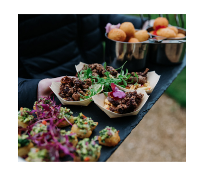
2:30 PM Now married, your reception begins with drinks and canapés on the patio.