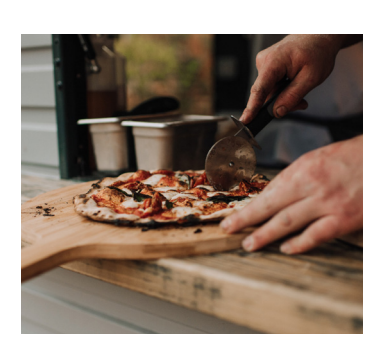
9 PM Party the night away with your guests and enjoy a choice of evening food.