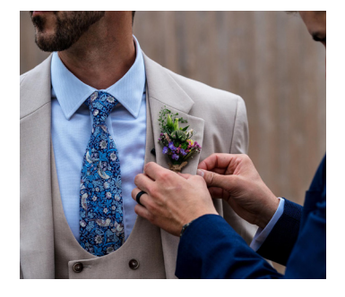
3 PM Any guests staying in the accommodation can now check in.