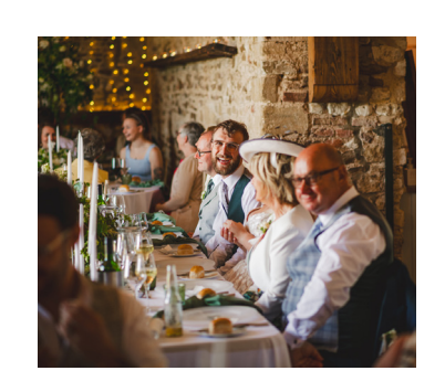
4:30 PM Your wedding breakfast is served – we recommend allowing two hours for this part of the day.