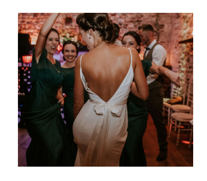
7:30 PM Your moment as a newlywed couple to cut the cake and have your first dance.