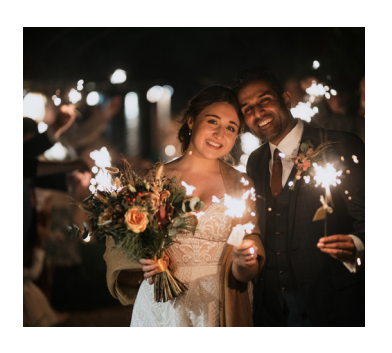
Midnight Your music comes to an end – time to retreat to your Honeymoon Suite.