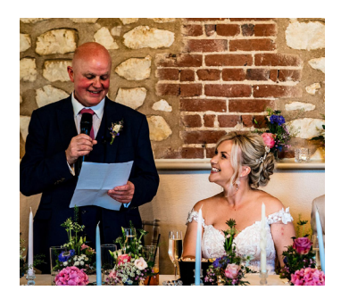
6:30 PM Time for the allimportant speeches.