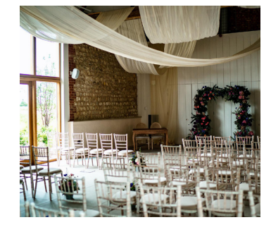
2 PM It's time for your ceremony in your choice of location.