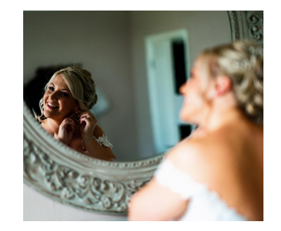
10 AM You and your wedding party begin getting ready in the Preparation Room.